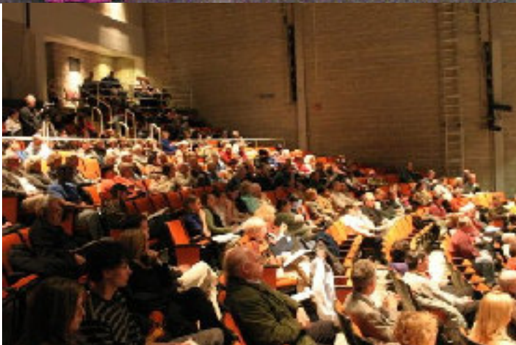
Below: Connie Ferguson