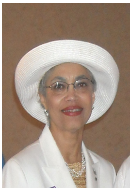
(Above) Debbie Macon in 'suffragette' white

In a video greeting, U.S. Senator Debbie Stabenow discussed the passage of the 19 th Amendment to the Constitution and the number of women elected to Congress over the years. She noted that while recent elections have resulted in an increased number of women in the Senate and the House, the total is still not representative of the population and encouraged more women to run for office.